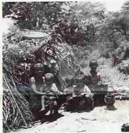
PYGMIES in front of their home in Zaire.

In the past 18 months, over 400 churches have begun and the number is growing daily. The pygmies arrived in their "forest attire" and the local Christians rallied around and clothed them with garments small enough to fit 10-year-olds. The Christians welcomed them into their homes and cared for them. We all clubbed in and contributed towards food for the